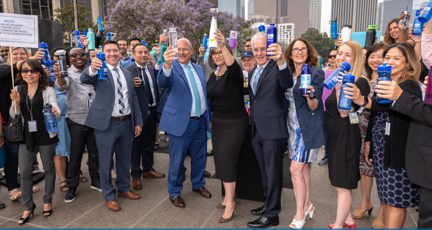
The 2019 Tap Water Day event celebrated our city's complex water planning, treatment, and monitoring infrastructure as a focal point of civic pride.