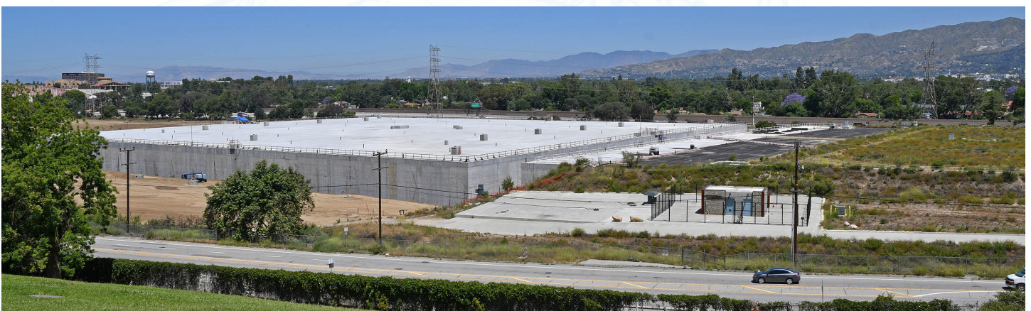
The Headworks Reservoir complex that includes Headworks East and West, stores a total of 110 million gallons of drinking water for Los Angeles and was built to meet water regulatory requirements.

Our challenges are many, now more than ever, but our employees are committed to providing you with clean, safe drinking water that you can depend on. They themselves are taking precautions to stay healthy, stay on the job and continue their vital service of providing water and following through on all our initiatives. Together, with your support, we will remain Water Strong.